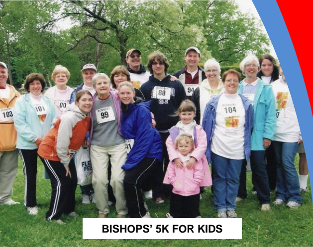
BISHOPS' 5K FOR KIDS