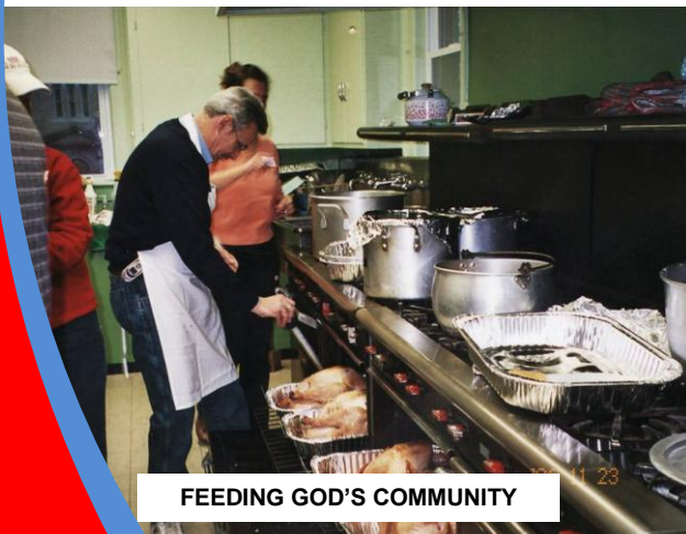
FEEDING GOD'S COMMUNITY